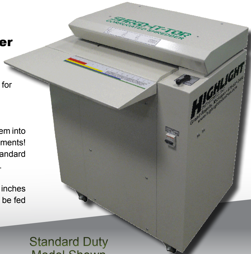
Standard Duty Model Shown

The Highlight Shred-It-Tor will shred 16.75 inches of material and cut any additional width to be fed back into the Shred-It-Tor.